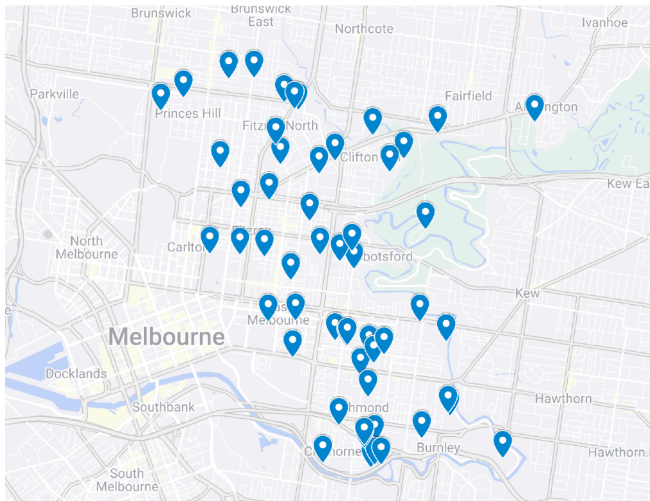
Map of play spaces in Yarra: https://streets-alive-yarra.org/play-spaces/

Streets Alive Yarra has prepared a map of play spaces in Yarra, showing the lack of options (e.g. within 500 metres) for households in that area.