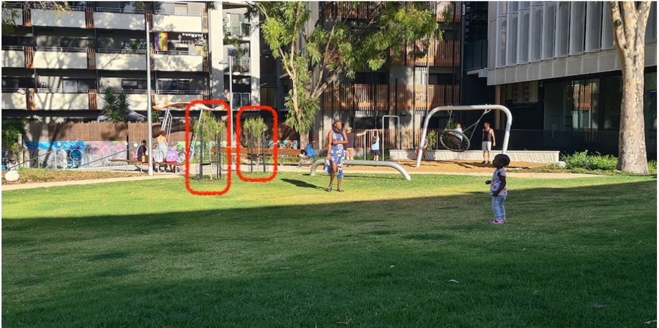
These two trees would be saved from removal.