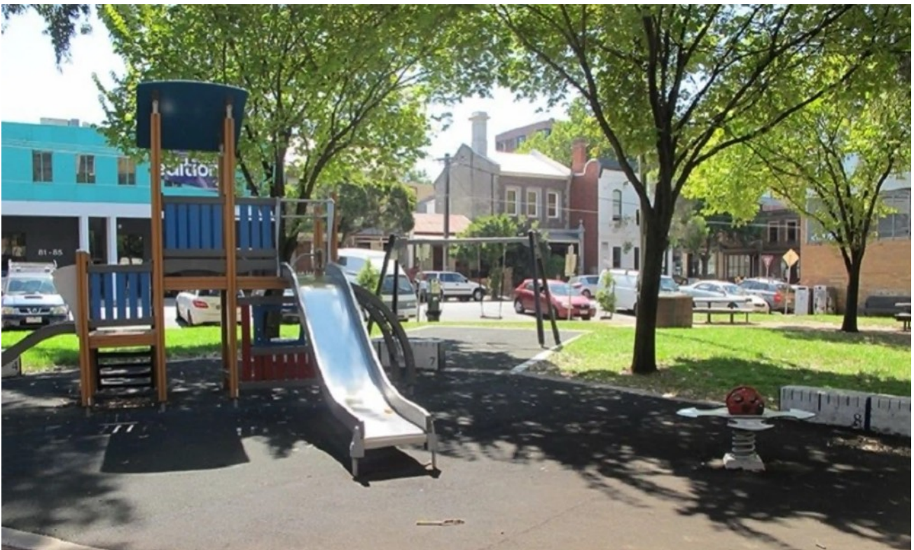
The proposed changes will not bring this back

For a location, we suggest the northern section of Cambridge Street.