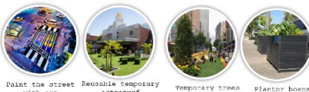
Paint the street with art