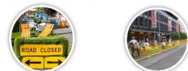
Shut part of the street for a 12 month trial